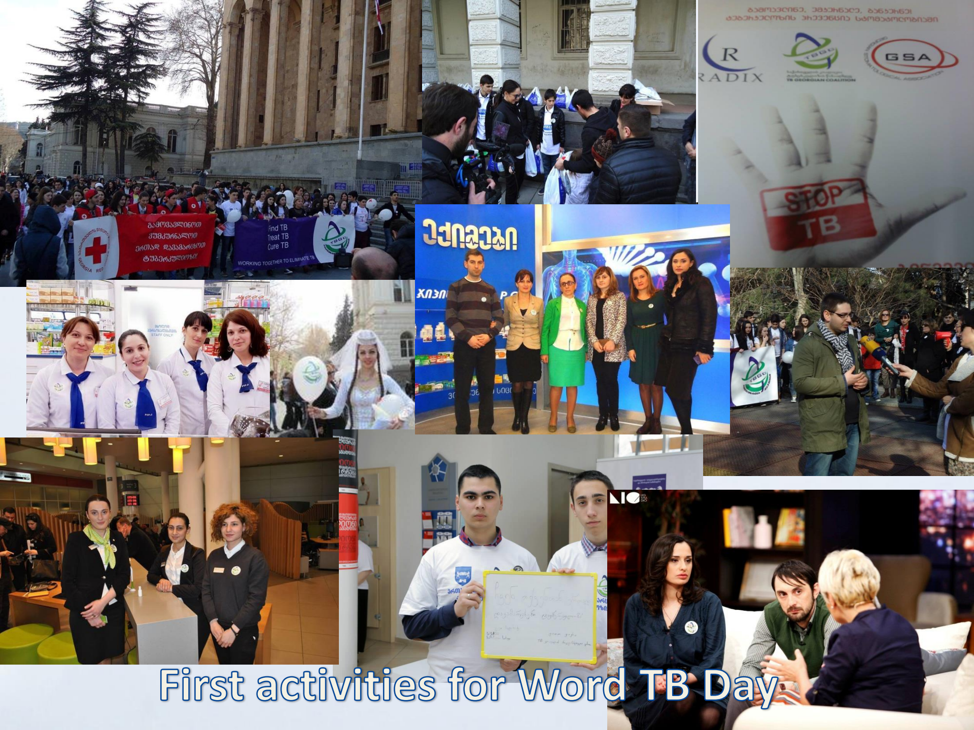
First activities for World TB Day